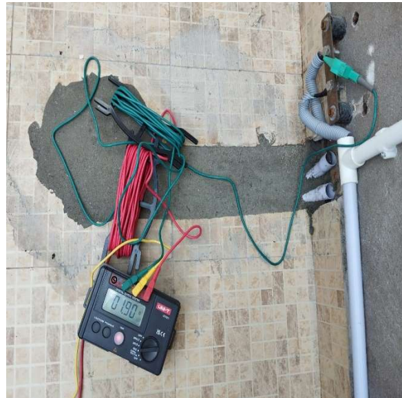
P.9&10 – Earthing (at least 2 photos showing the test values of both AC & DC earths)