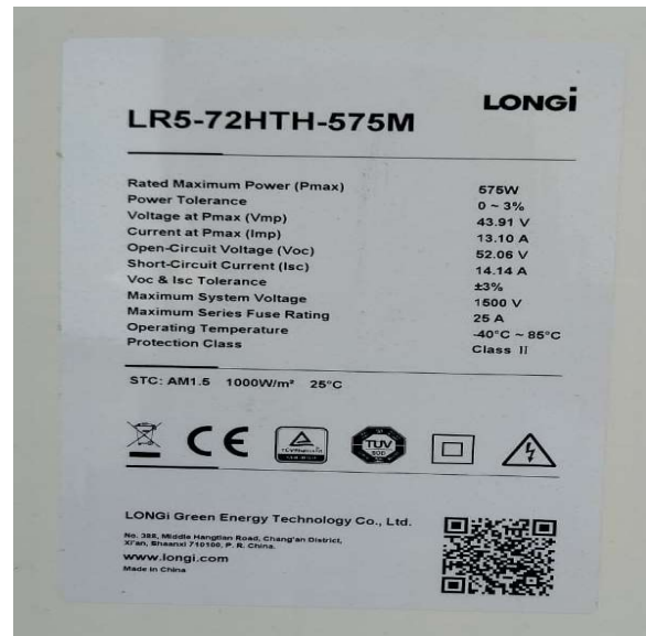
P.1 – Solar Panel Label (with readable Specs)