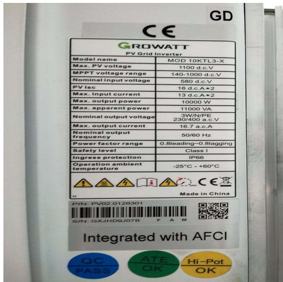
P.1 – Inverter Label (with readable Serial & Specs)