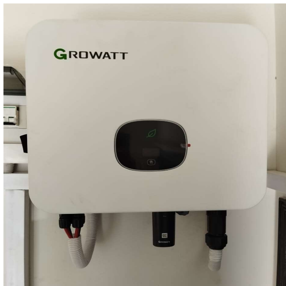
P.3 – Installed Inverter (close view)