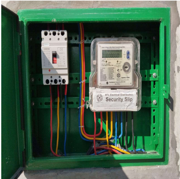
P.7 – Metering Point (close view)