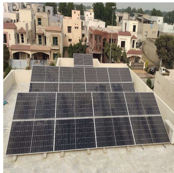
P.5&6 – Solar Panels (at least 2 photos showing the complete view of installed solar panels)