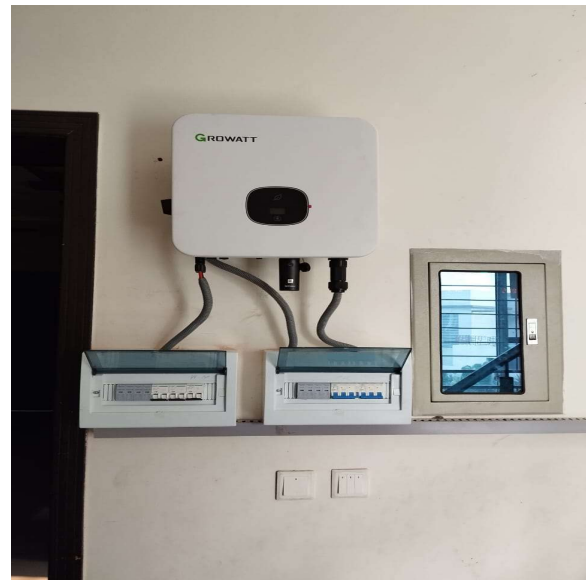
P.4 – Installed Inverter (far view)