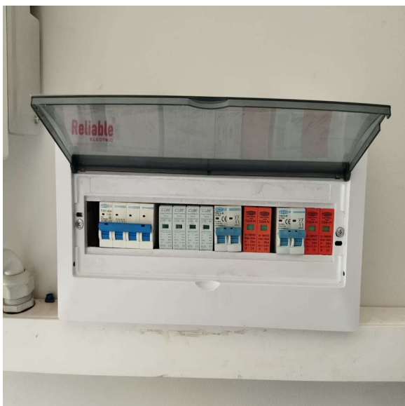
P.11 – Combiner Box (showing SPDs & breakers)